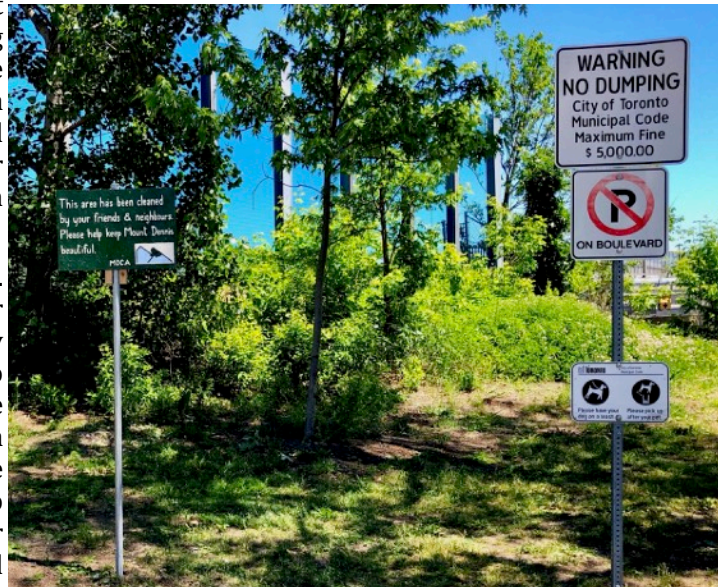
MDCA volunteers installed these posts on the Railway Lane Parkette to discourage parking on the grass.

There is an area known as Railway Lane Parkette on Ray Ave. Despite Metrolinx’s promises, its contractors often park their trucks on the green-space, so this summer MDCA and nearby residents cleaned the parkette and put up signs and posts to discourage parking. Nearby, a bright flashing red light above the LRT’s Maintenance and Service Facility was bothering area residents. MDCA researched and presented evidence that the light was not needed for aviation safety, and Metrolinx agreed to shut it off. We continue to work with Metrolinx to make our neighbourhood safe and accessible to everyone. Finally, this fall we asked the City to find a way of making the SE Flats, including Topham Pond, wheelchair accessible.